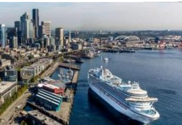
Mobility 4.0: Planes, Trains & Port Districts