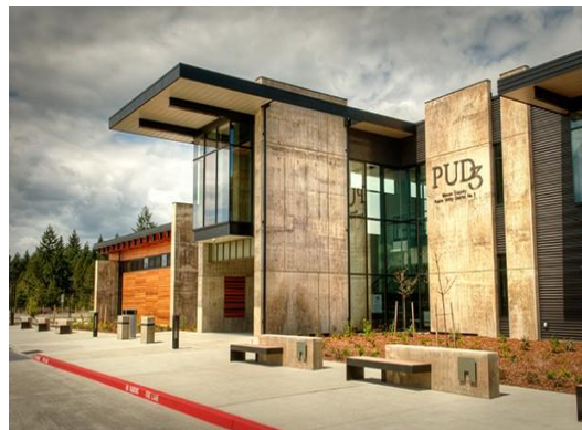
Mason County PUD No. 3