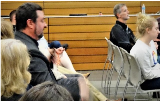
Town Hall Forum Participants

With over 45 people attending, a diverse cross-section of the community was represented, including people with disabilities, family members, service providers and several elected officials.