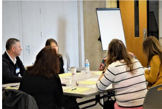
Leadership Breakfast Participants