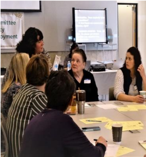
Leadership Breakfast Participants